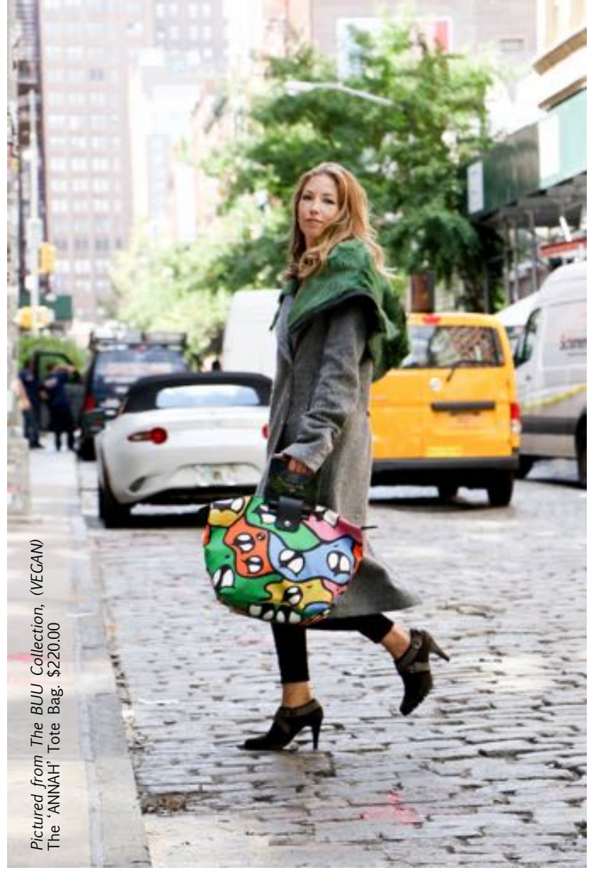
Pictured from The BUU Collection, (VEGAN) The 'ANNAH' Tote Bag, $220.00