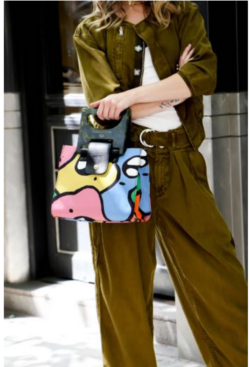
Pictured from The BUU Collection, (VEGAN) The 'HANNA' Shopper Bag. $245.00 (comes with detachable strap).