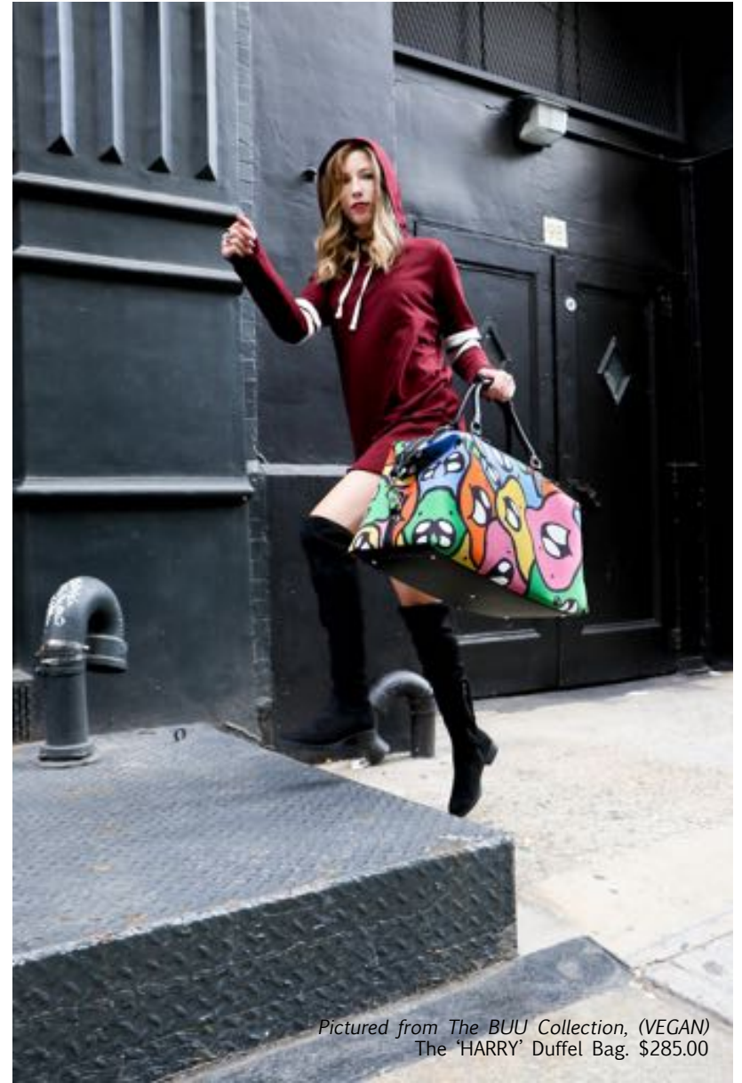
Pictured from The BUJ Collection, (VEGAN) The 'HARRY' Duffel Bag. $285.00